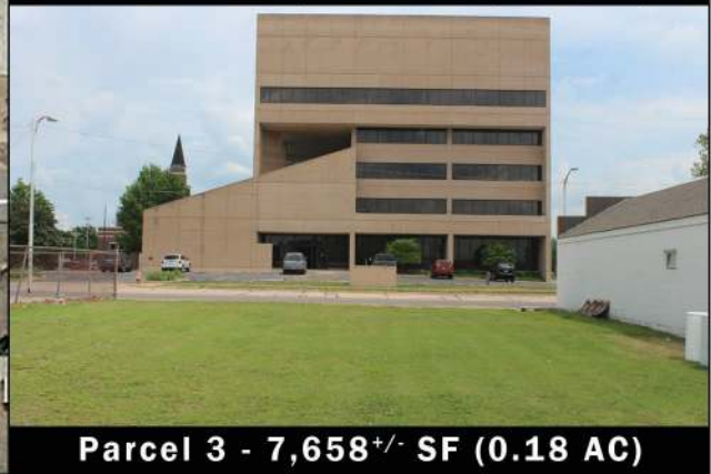
Parcel 3 - 7,658 +/- SF (0.18 AC)