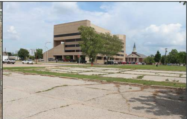
Parcel 2 - 12,600 +/- SF (0.29 AC)