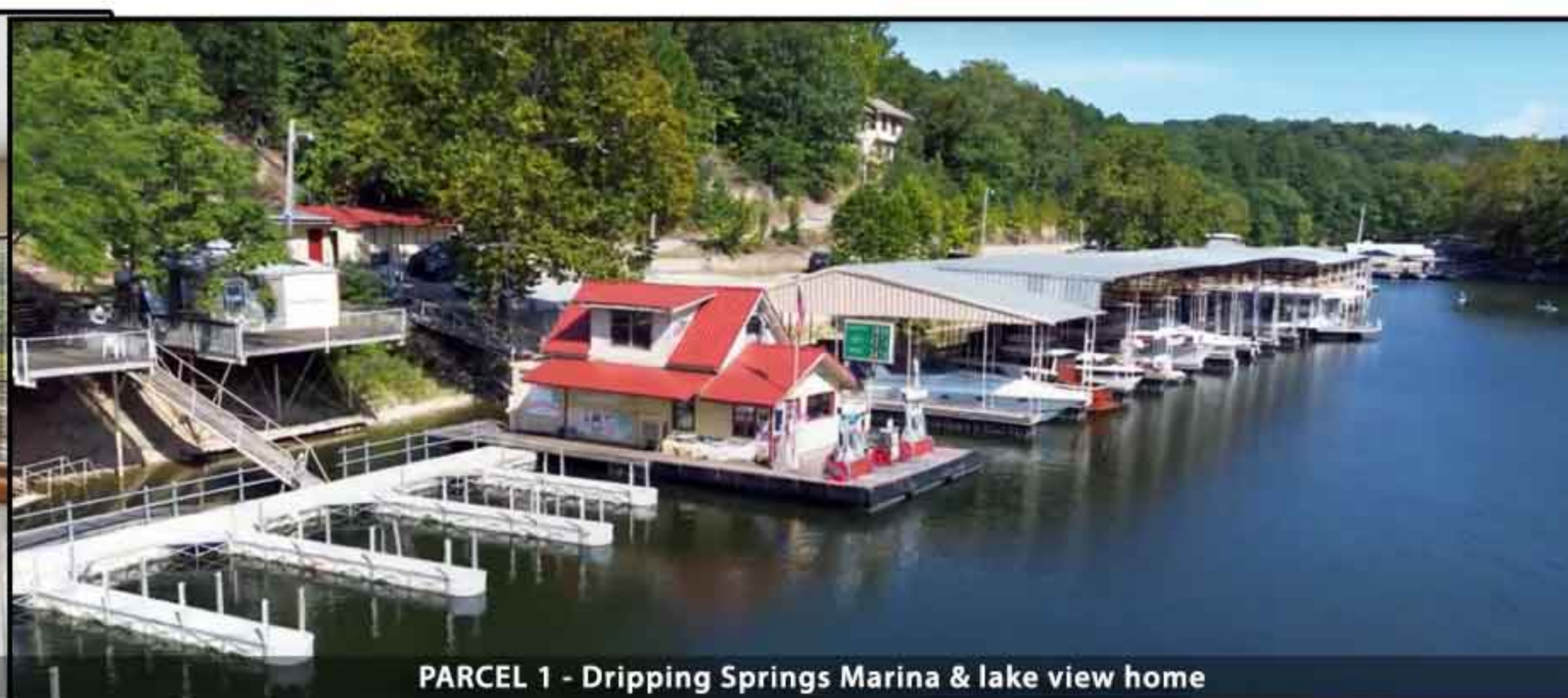
PARCEL 1 - Dripping Springs Marina & lake view home