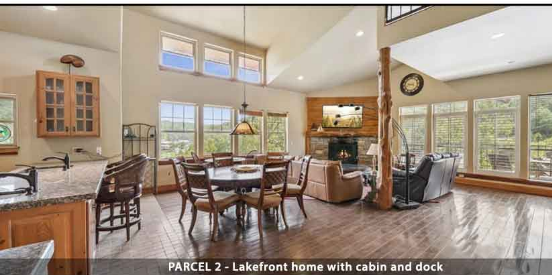
PARCEL 2 - Lakefront home with cabin and dock

PARCEL 7 - 2.7 + ac lake view development land.