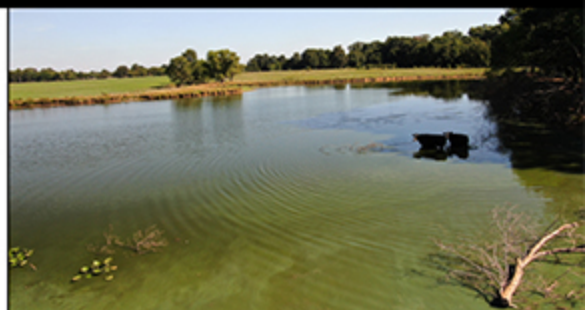
7 STOCK PONDS

SOIL: Mostly silt loam w/ some silty clay loam