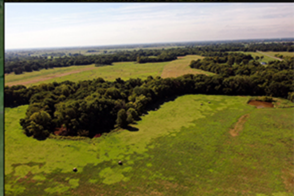
WHITEAILS & WATERFOWL