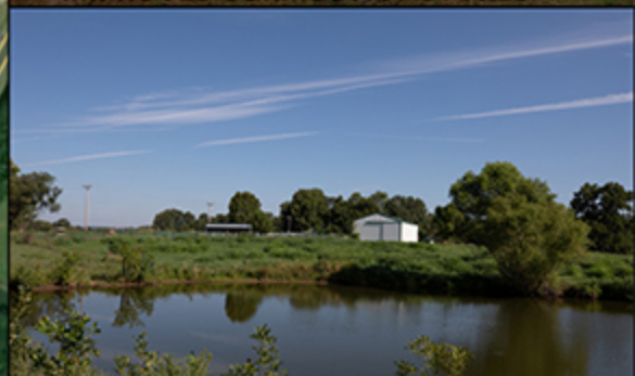
60'x30' BARN/SHOP & PENS