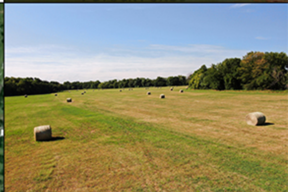
IMPROVED BERMUDA PASTURES