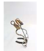
Pointer 171 Bit, Bars & Flower