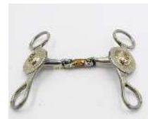
642 Klapper 45 "S" Bit