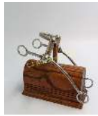
625 Eldonian Bit