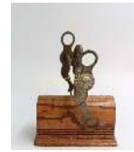
627 EG bit