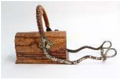
628 Klapper 228, Roping hackamore "LL"