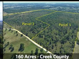
160 Acres - Creek County