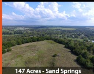
147 Acres - Sand Springs

Land, Homes & Com'l Real Estate Nov 15 & 16