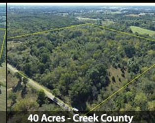
40 Acres - Creek County