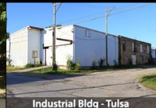
Industrial Bldg - Tulsa

3% Buyer-Broker Compensation | online bidding available