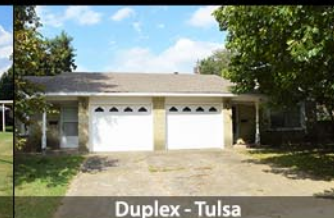
Duplex - Tulsa