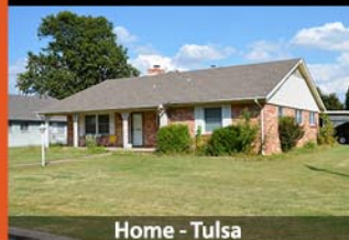
Home - Tulsa