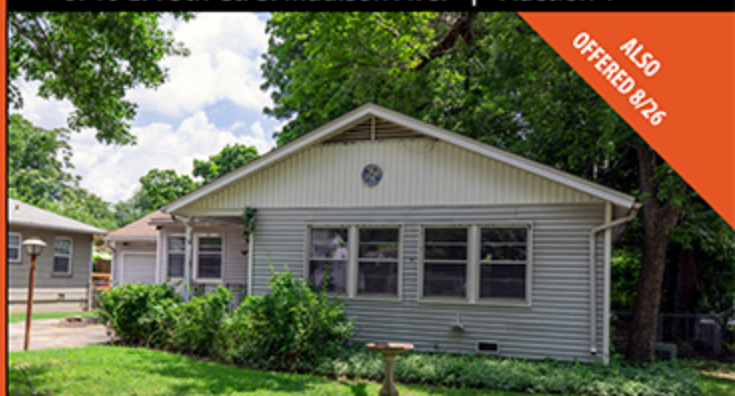
3523 S. Knoxville Ave., Tulsa | Auction 2:30 pm