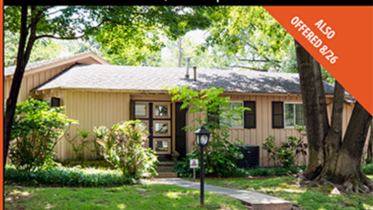
3037 S. Madison Ave., Tulsa | Auction 4 pm