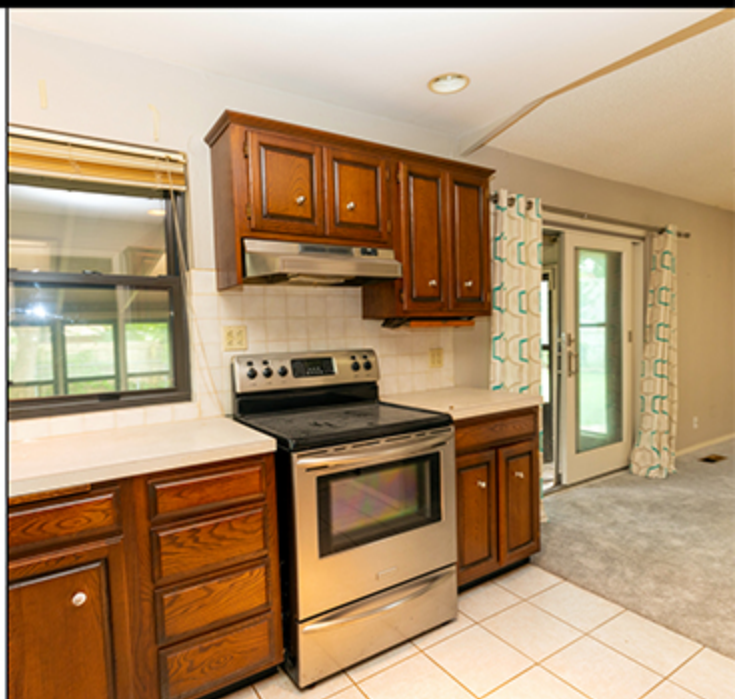
6710 E. 75th Ct. S. Madison Ave. | Auction 1 pm

VISIT CJ-AUCTIONS.COM FOR COMPLETE TERMS, CONDITIONS AND DISCLOSURES.