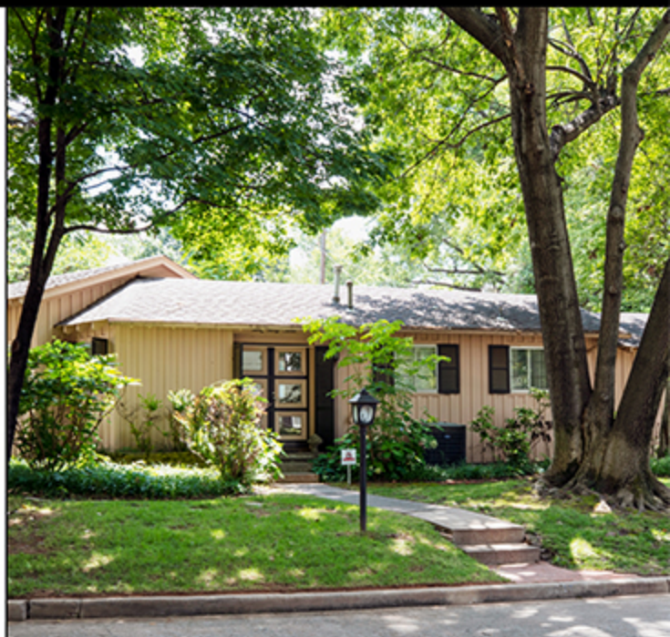
3037 S. Madison Ave. | Auction 4 pm