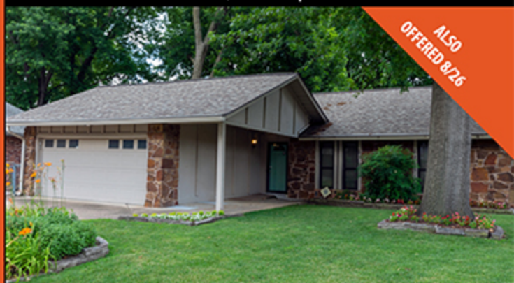
6710 E. 75th Ct. S., Tulsa | Auction 1 pm

VISIT CJ-AUCTIONS.COM FOR COMPLETE TERMS, CONDITIONS AND DISCLOSURES.