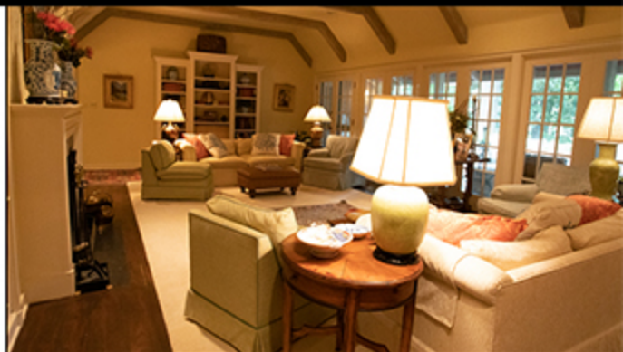
Natural light pours throughout the open floor plan