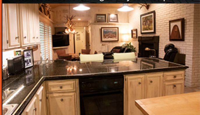
Beam ceilings, plantation shutters & custom built-ins