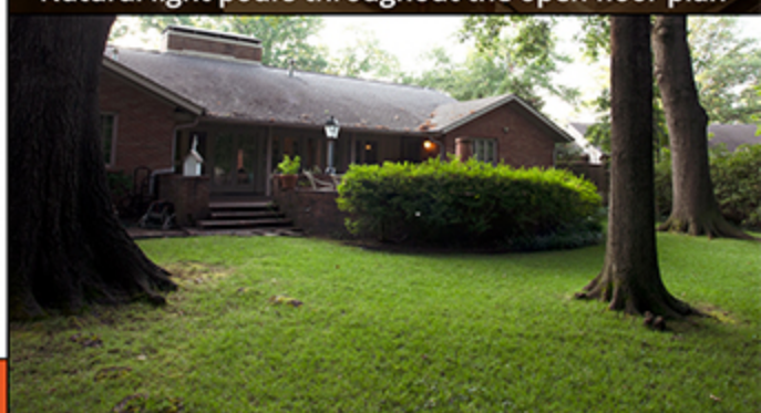
Park-like yard with giant oak trees