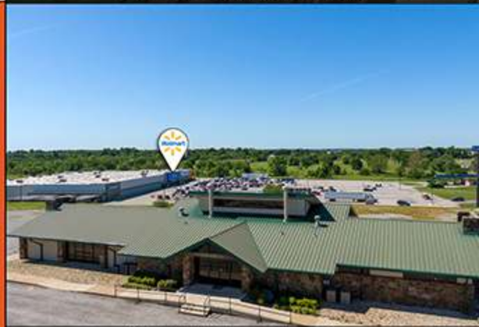
High Visibility | Two-Story

VISIT CJ-AUCTIONS.COM FOR COMPLETE TERMS, CONDITIONS AND DISCLOSURES.