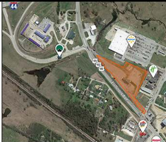
945 E. Illinois Ave., Vinita, OK