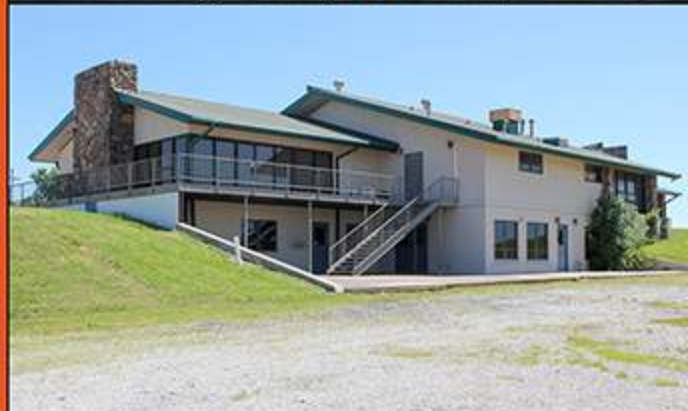
6,252 SF | Built in 1980