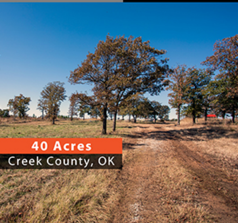
40 Acres Creek County, OK