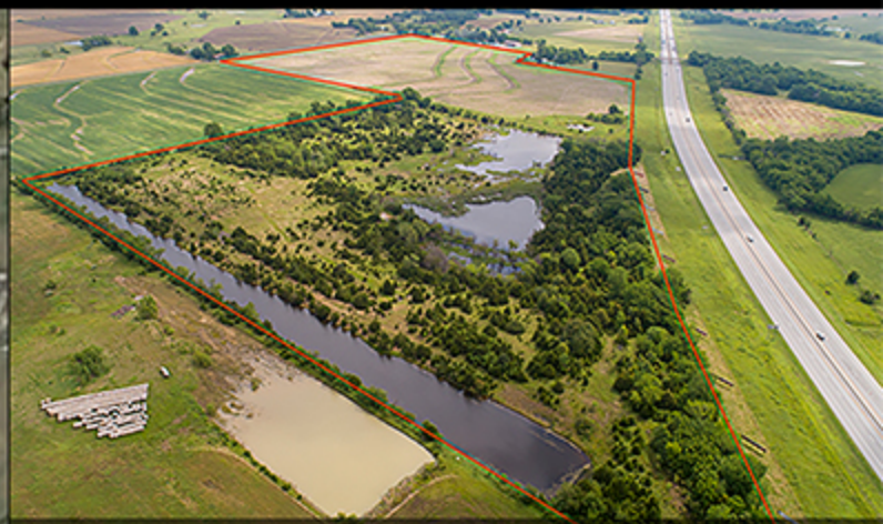
LOOKING NE ACROSS PARCELS 1-5