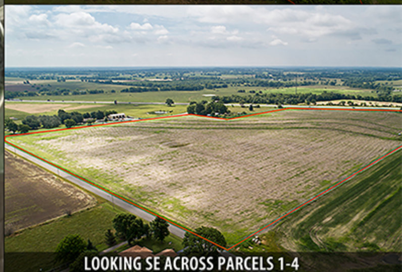
LOOKING SE ACROSS PARCELS 1-4