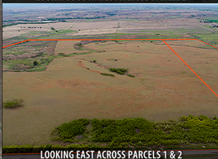
LOOKING EAST ACROSS PARCELS 1 & 2