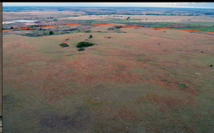
LOOKING SOUTHWEST ACROSS PARCEL 2

Parcel 2 - Estimated 76ac in CRP @ $26.96/ac ($2,048.90 annually)