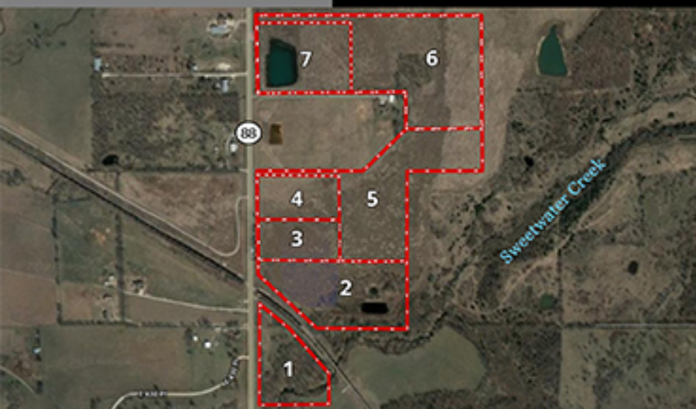
83 1/2 Contiguous Acres | Rogers County, OK