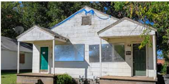
2432-2434 S Phoenix Ave, Tulsa