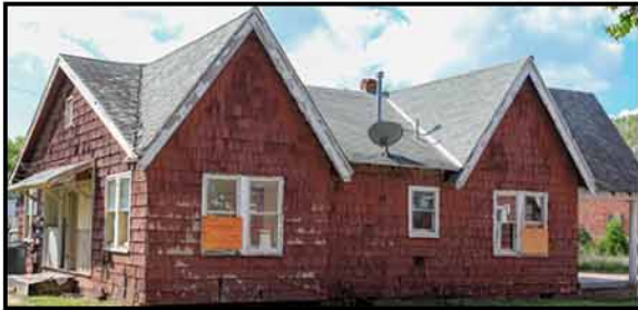
1245-1247 S Lewis Pl, Tulsa

1 Bedroom, 1 bath duplex with hardwood floors, living area, kitchen and dining/breakfast nook. Spacious front and back yards with extra parking behind the units. Unit 1241 has an extra bedroom, living area, bathroom and kitchenette that could be converted to an additional rental unit.