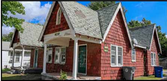
1241-1243 S Lewis Pl, Tulsa