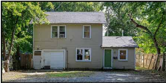
1123-1125 S Yorktown, Tulsa

NOTE: Sells as a single property with 1241-1243 S Lewis Pl. 2017 property tax: $1,961.75