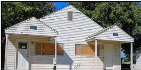
2436-2438 S Phoenix Ave, Tulsa