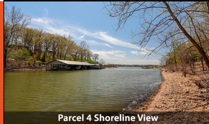
Parcel 4 Shoreline View