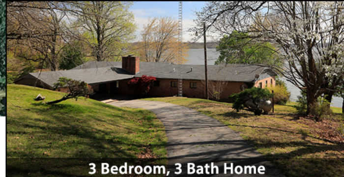
3 Bedroom, 3 Bath Home

PARCEL 5: 21.62 ± acres, 852 ± feet lakefront