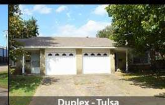
Duplex - Tulsa