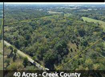
40 Acres - Creek County