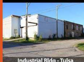
Industrial Bldg - Tulsa