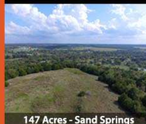
147 Acres - Sand Springs

Land, Homes & Com'l Real Estate Nov 15 & 16