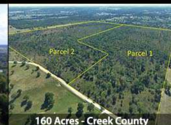
160 Acres - Creek County