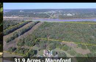
31.9 Acres - Mannford

3% Buyer-Broker Compensation | online bidding available